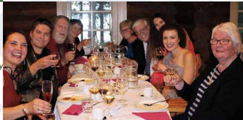
Attendees enjoy a Karelian Feast at Bomba House in Nurmes.