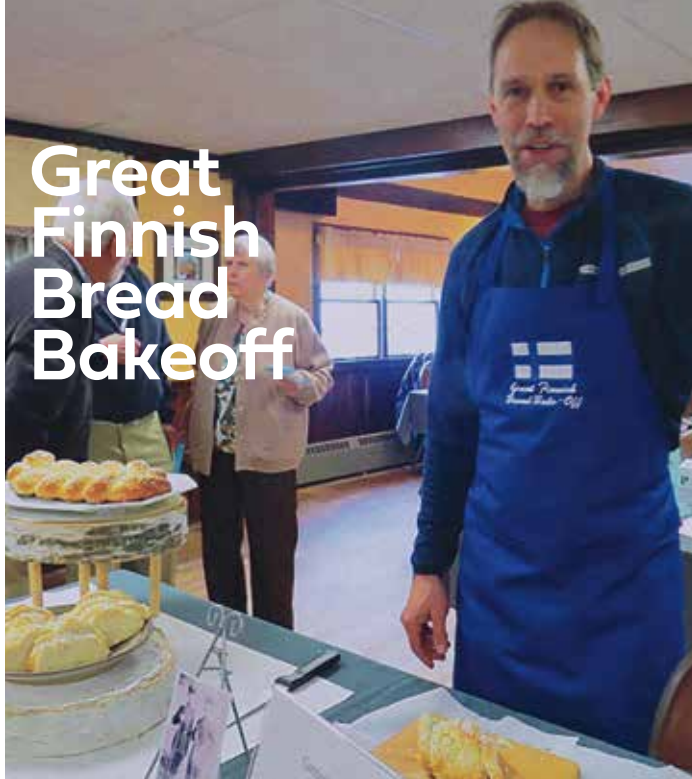
A baker shows off his pulla entry.