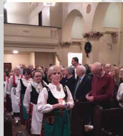
A procession at the New York Metropolitan Chapter's Independence Day Celebration.

The New York chapter hosted multiple events throughout the year, from a September Street Fair on Bleecker Street to the performance of Sibelius Inspiration at Scandinavia House in November. The December 6 Finnish Independence Day Celebration at Park Avenue United Methodist Church (below) featured the invocation by Pastor Tiina Talvitie of the Finnish