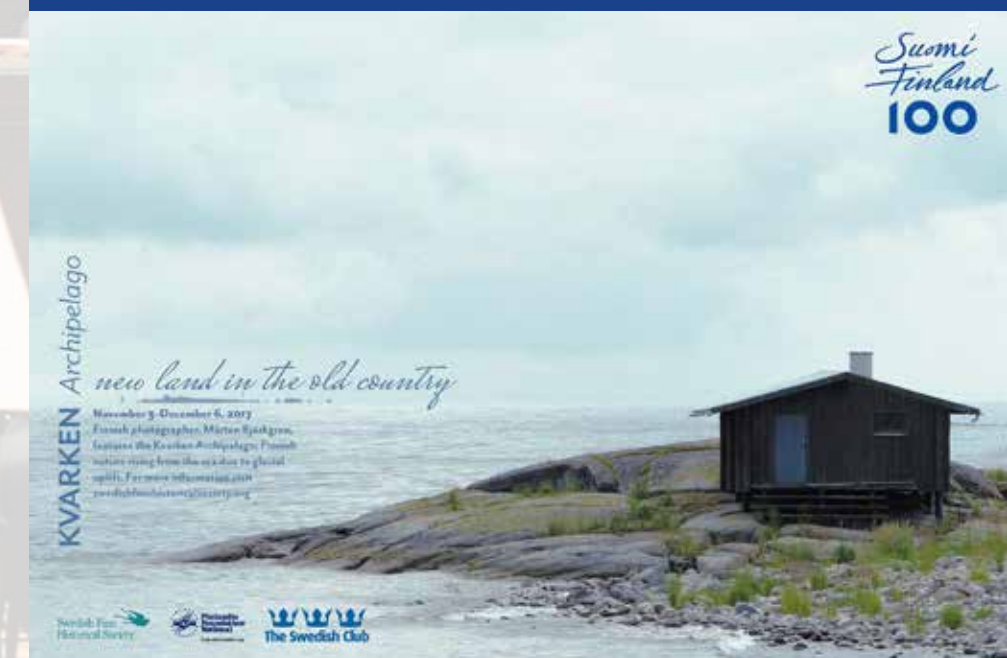
FINLAND 100 5