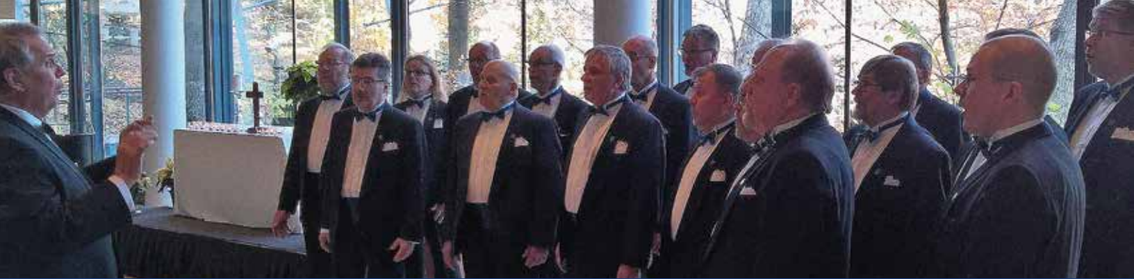
Keravan Mieslaulajat performed at the Independence Day gala at the Finnish Embassy in Washington, D.C.