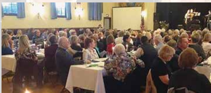
Finlandia Foundation Berkeley Chapter filled its Finnish Hall with a crowd of about 270 for the Finland Independence Centennial Gala on December 3. The classic 1930s building was formerly known as the United Finnish Kaleva Brothers & Sisters Lodge #21.