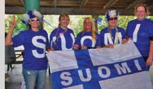
FinnsConnect South Florida and the Finnish American Chamber of Commerce teamed up to welcome spring at a Vappu picnic in the park in Pembroke Pines. It drew more than 120 members and "Finthusiasts," including dozens of children. FinnsConnect wrapped up the Finland 100 year with a December 2 dinner party at a waterfront restaurant in Fort Lauderdale.