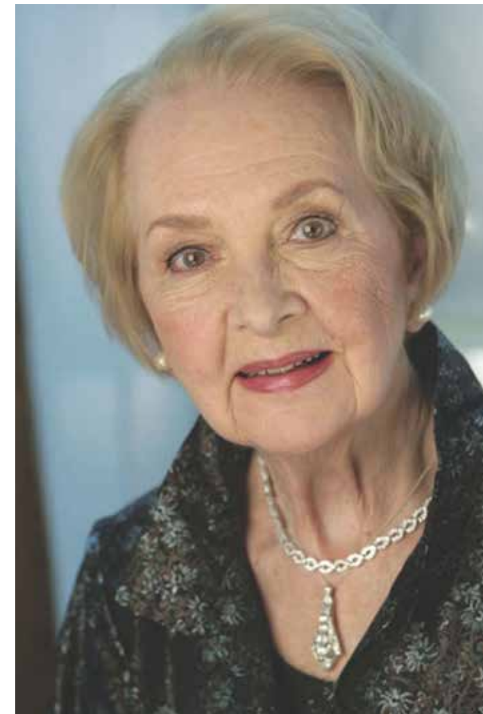
As Lecturer of the Year, Taina Elg talks about her career on stage and screen.