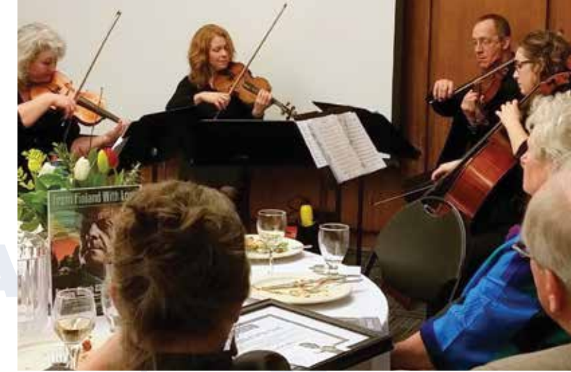
Melegari Chamber Players perform works by Sibelius at the FFCPC Valentine's Day dinner and concert.