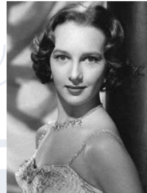
Hollywood starlet Taina Elg.

Taina was born in Finland near the Russian border in 1930, and was forced to resettle, with her family, in Turku after the war. As a child actor she was invited to join the Finnish National Ballet in Helsinki. In 1954, while working with a ballet company in England, she was discovered by an American movie producer and offered a contract with MGM Studios. That was her big break.