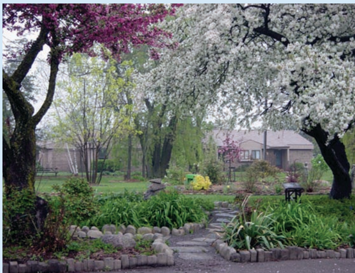
FINLANDIA GARDENS at the Finnish Center Association in Farmington Hills, Michigan.

Voluntary donations support the maintenance and development of our gardens. Open from dawn to dusk daily, we are increasingly recognized as a point of interest in the local community. For more information about FCA and Finlandia Gardens, please visit our websites: www.finlandiagardens.org and www.finnishcenter.org .