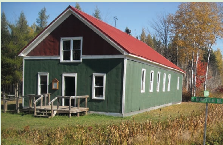
The Sugar Island (Michigan) Historical Society Finn Hall

This success story continues with an increase in donations of historic items, including looms and other personal items. There has been an interest in holding memorial services in the Hall and also receptions. Once the building has been returned to its former glory, the group will be renovating a one-room schoolhouse on the island.